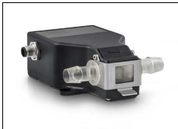
Fig 1. FLEXMAG 4050 C